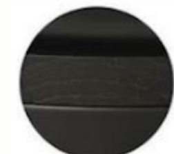
Black oak lid