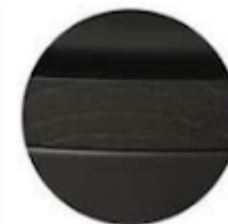
Black oak bowl